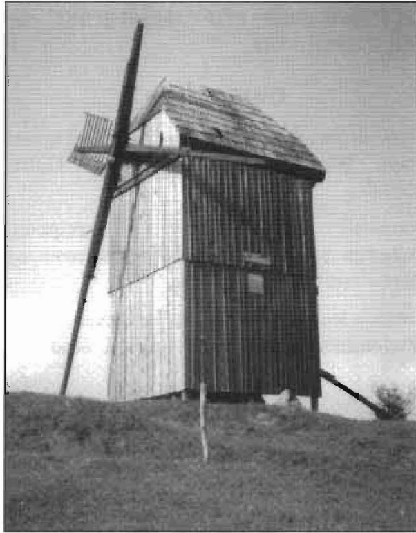
Village of Gulcz